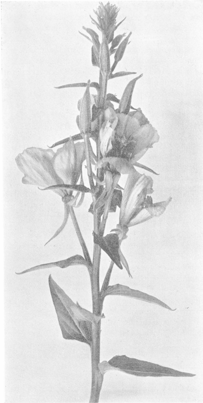
FIGURE 2.— Oenothera suaveolens mut. fastigiata , Aug. 13, 1915, showing the erect position of the flowers. Cf. fig. 4. Mutant of 1915.