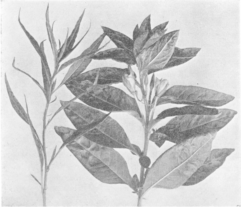
FIGURE 1.— Oenothera suaveolens mut. lata (broad-leaved) and mut. jaculatrix , July 17, 1915. Side branches of mutants of 1915.

mens of the previous year. The cultures embraced 150 seedlings each, giving a percentage of almost 1 percent lata (0.7 percent). The two mutants were exactly the same in outward appearance and in hereditary behavior. One of them was weak and did not yield any fertile pollen; the other was very vigorous and richly branched, without pollen during the first two weeks of its flowering, but producing afterwards a sufficient supply for artificial self-fertilization. The female flowers were fecundated with the pollen of one of the typical suaveolens individuals of the race and thus I got three sets of seed. From these I had the second generation in 1916; it consisted partly of lata , repeating the characters of the parent, partly of pure suaveolens and partly of mutants. Among these, the lutescens were frequent, the jaculatrix rare and no others were observed. I counted the cultures in the beginning of May, when the differences were sharp. They amounted to 54 individuals from the self-fertilized seed and 69 and 70 from the two crossed lots. The percentage composition of the three sets was as follows: