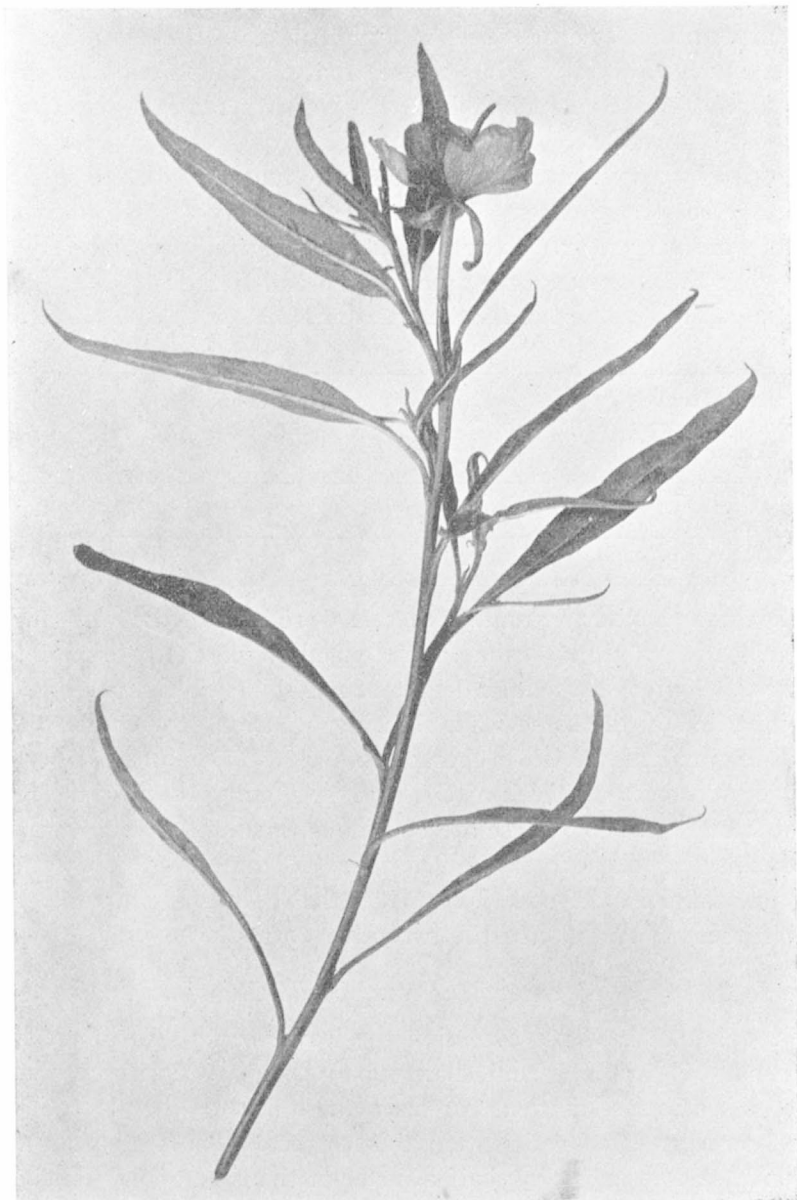
FIGURE 3.— Oenothera suaveolens mut. jaculatrix , Aug. 13, 1915. Flowering side branch of second generation.