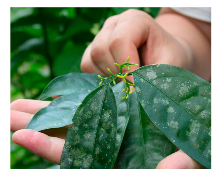
Fig. 2. Field photograph of general structure of Haptanthus hazlettii inflorescences.

group (revealed in all representative phylogenetic analyses of Buxaceae; e.g., von Balthazar et al., 2000, and von Balthazar and Endress, 2002), ML provided a position sister to the Buxus clade (Fig. 1). The immediate sister group to the expanded Buxaceae is Didymeles ; this position also has been obtained in all previous phylogenetic analyses.